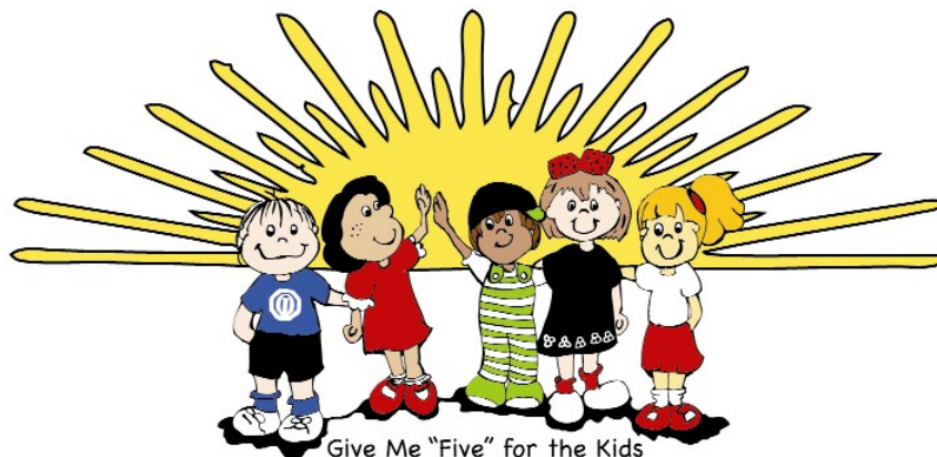
Give Me "Five" for the Kids Donne-m'en « cinq » pour les enfants 2008-2009